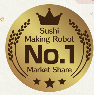
Fuji Keizai [Labour shortage and Potential Demand & Consideration on Automated Robots] Results for 2022 Sales Quantity and Value for Sushi Making Robot